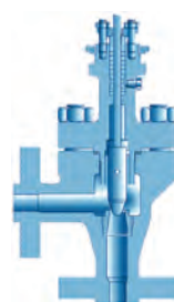
Typical MIL 70000 Angle body construction