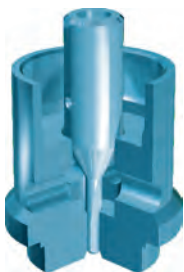
Micro-flow high pressure drop plug and seat construction with extra guiding