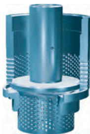
Double stage low noise / anti-cavitation trim design for severe service